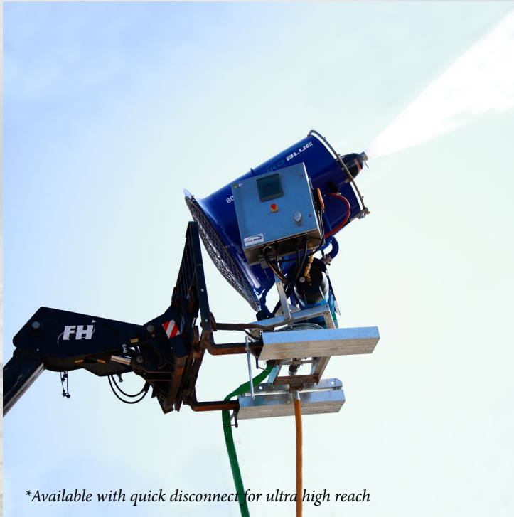
*Available with quick disconnect for ultra high reach